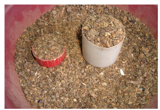
Most farmers rely on saved seeds

African indigenous vegetables (AIV) have traditionally been a significant contributor to food security and nutrition for smallholder farmers in East Africa and are also important in providing incomes, particularly for women who sell vegetables at local markets to supplement their income. However, the potential to meet a growing demand for these vegetables has been limited by lack of good quality seed. In Africa, less than ten per cent of the seed planted is purchased from the formal market. The Association for Strengthening Agricultural Research in Eastern and Central Africa (ASARECA) facilitated a partnership of organisations, led